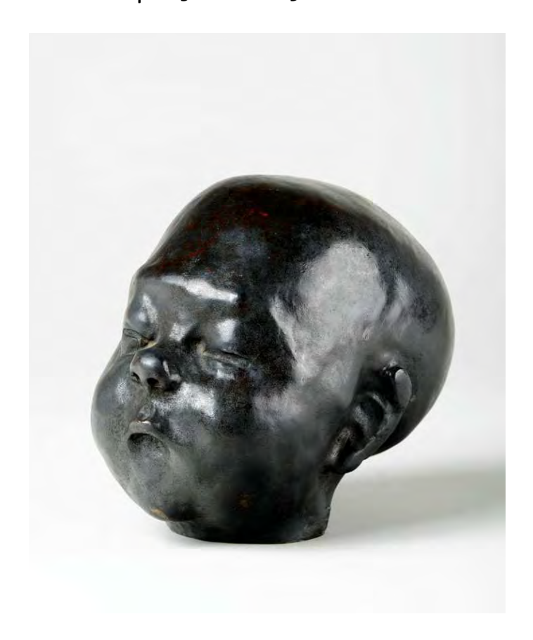
Sir Jacob Epstein, Baby Asleep, 1904.

© The estate of Sir Jacob Epstein