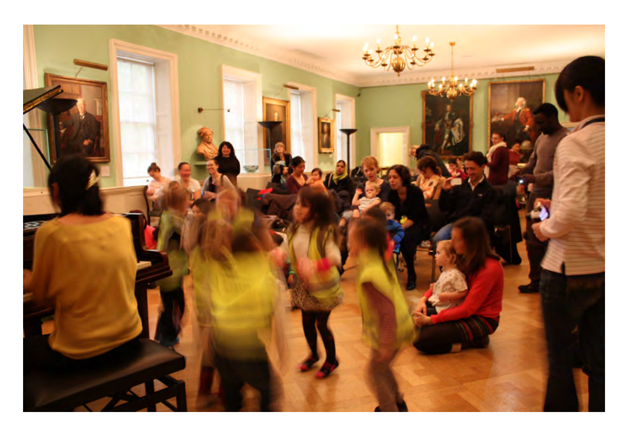
Participants in a Bach to Baby session in the Picture Gallery, including children from Coram Nursery.