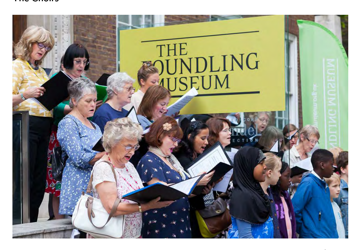
The Foundling Community Choir and the New Foundling Choir performing at the Museum's 10<sup>th</sup> Birthday weekend

The New Foundling Choir was made up of 20-30 primary school pupils aged 10-11 years from 8 Camden schools, who have been identified as having musical talent but who are not involved in extra-curricular musical activities. The Choir met every Monday afternoon during term time and was run in partnership with Camden Music Service and the Orchestra of the Age of Enlightenment. The New Foundling Choir performed at the 10<sup>th</sup> Birthday celebrations in June and had its final concert in July in the Museum, with members of the Orchestra of the Age of Enlightenment.