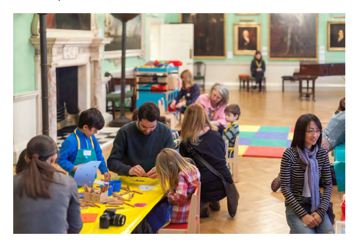
The Art Trolley in use during a family workshop in the Picture Gallery.

Eight students and three lecturers from the BA Jewellery Design course at Central Saint Martins worked together as equals and with the Foundling, researching the Hospital archive and the Collections. The resulting jewellery was displayed in the Introductory Gallery and the Ante Room alongside the objects that had inspired them. Accompanied by a fully illustrated catalogue the display ran from 14 November 2014 – 30 January 2015 and over 100 people attended the launch event including the Head of Central Saint Martins.