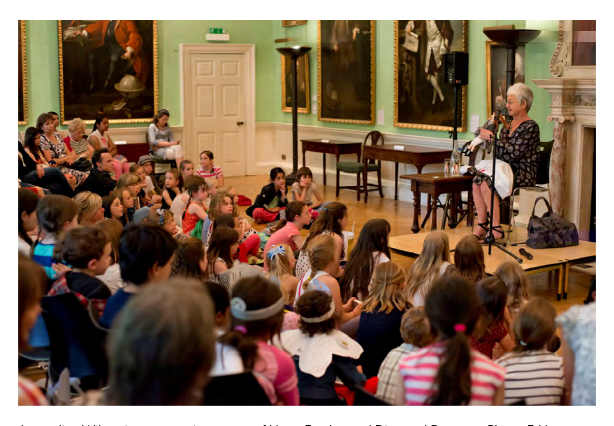
Jacqueline Wilson in conversation as part of Hetty Feather and Diamond Day 2014

2008 Foundling Fellow, Jacqueline Wilson returned to the Museum for a Hetty Feather and Diamond Day to celebrate the paperback release of Diamond. Over 110 people booked this event and another 128 people attended events throughout the day including free drop-in workshops, and a range of activities and competitions, culminating in a reading and book signing by Wilson. A new Hetty Feather trail was also launched in the Museum and online.