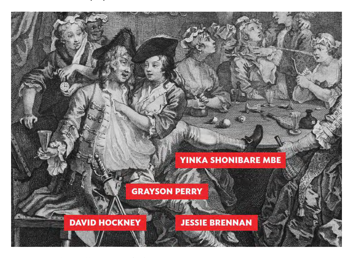
Progress , 2014 designed by Joe Ewart for Society