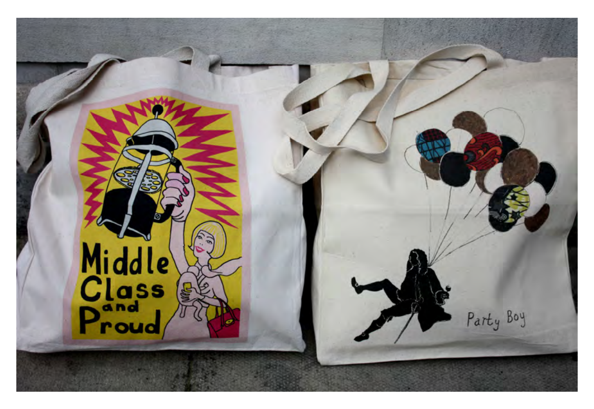
Tote bags designed for the Museum for Progress by Grayson Perry and Yinka Shonibare MBE

The Museum purchased over £100,000 of artworks from the Foundling Hospital Collection for the Museum's Collection, as well as an autograph letter from Charles Dickens which was secured with support from the Arts Council England/Victoria and Albert Museum Purchase Grant and the Friends of the National Libraries.